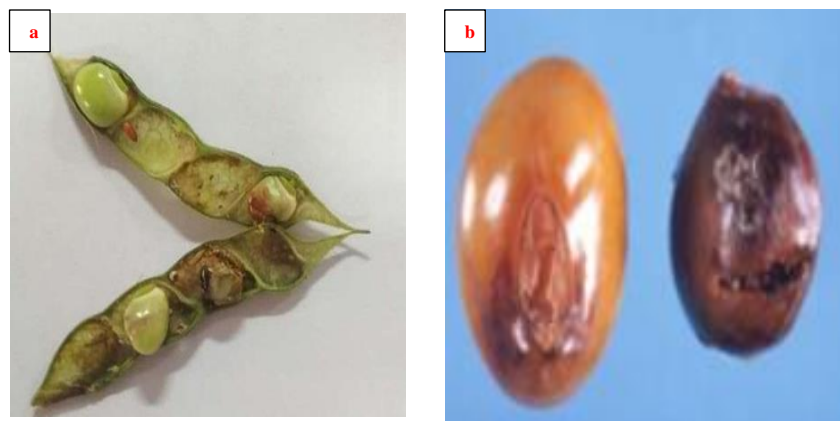
a: pod, b: seed

Nature of Damage: The adult fly lays eggs in developing grains using its sharp ovipositor and larvae feed on developing seeds by making a tunnel. Larva consumes its starchy portion and embryo, damaged embryo became unable to germinate, and grains become shrivel. They excrete a trail of excreta, lead to the development of saprophytic fungus, which renders the seed inedible.